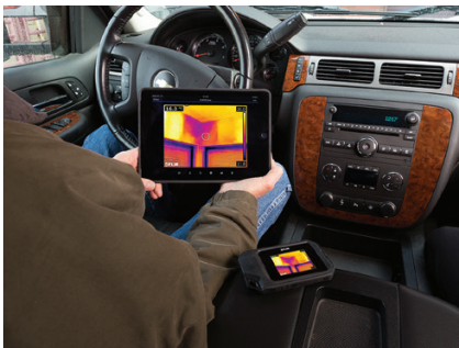
Upload images to FLIR Tools over Wi-Fi